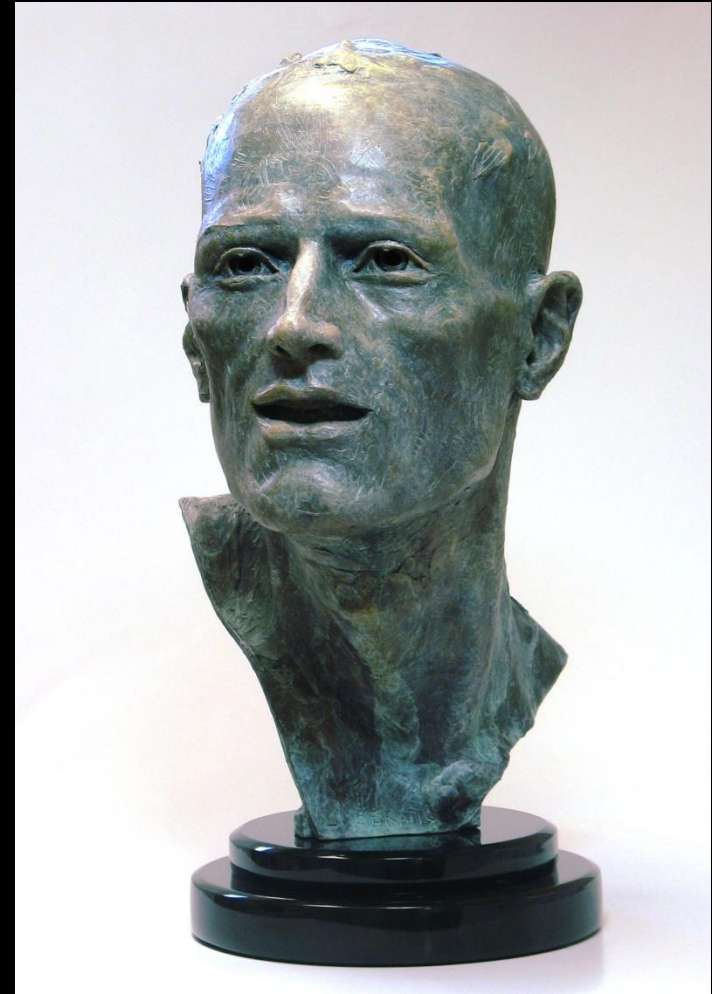
Left: Sculpture in clay. Above: Actual bronze head with patinas.