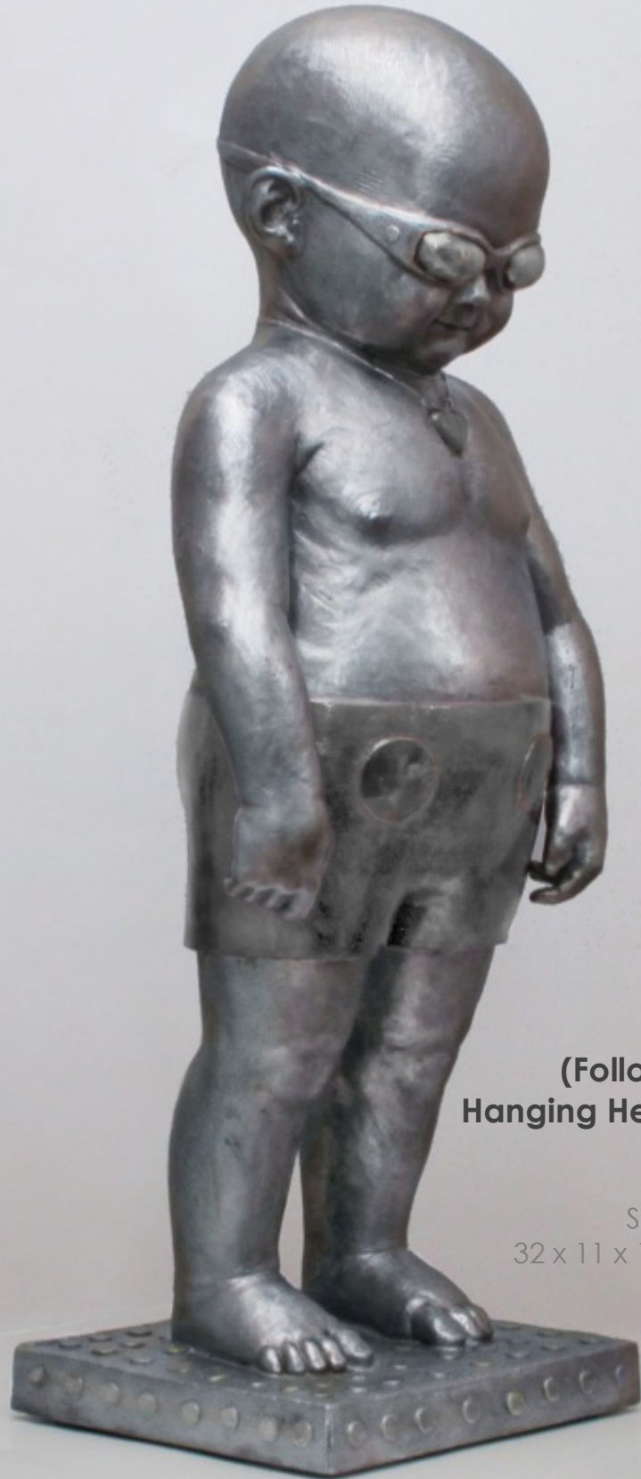
THE TOT (Follow Your Dreams Hanging Heart Spot Companion)

Stainless Steel 32 x 11 x 11 in (81 x 28 x 28 cm)